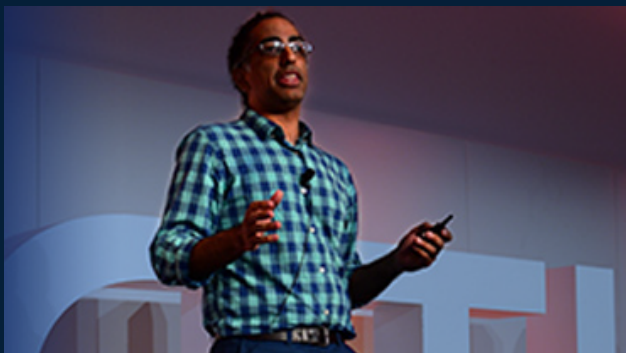
Because every big project worth doing needs a highly experienced, collaborative, learning & performance geek. Let's chat.